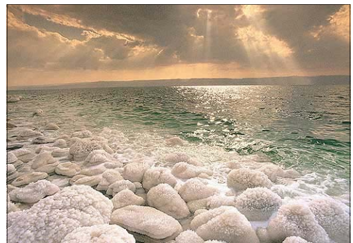
Tucked in between the rugged wilderness of the Judean Wilderness (top), and the inhospitable waters of the Dead Sea (bottom) is the refreshing oasis of En Gedi.